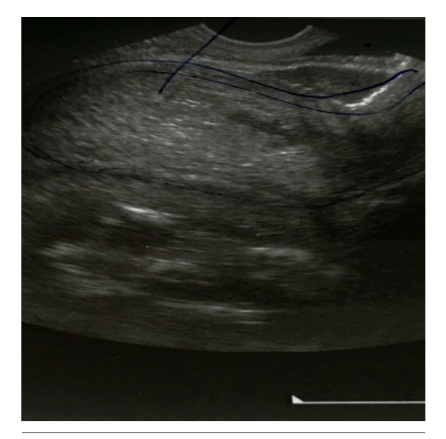
Figure 1: Ultrasound findings showing an empty uterus and a pregnancy in the Pouch of Douglas.

A bedside abdominal ultrasound was done by the gynecology team, which revealed a large collection