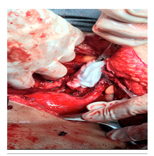
Figure 3: The area in the Pouch of Douglas where the abdominal pregnancy was retrieved.

had a postoperative bout of paralytic ileus, which was managed conservatively. She made a good recovery and was discharged home on the fifth postoperative day.