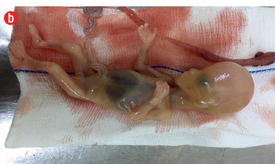
Figure 2: (a) Fetus and membranes retrieved from the Pouch of Douglas. (b) The fetus.